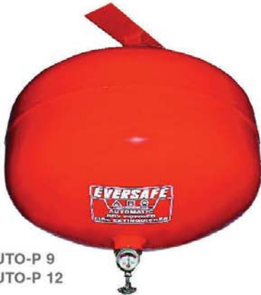
AUTO-P 9 AUTO-P 12

The EVERSAFE™ automatic dry powder fire extinguisher is effective on all type of fires - Class A, B, C & electrical . The monoammonium phosphate (MAP) and ammonium sulphate agents are non electricity conductive. It is ideal for unmanned area where continuous protection is required and a mixture of fire risks is present. It's wide effective coverage reduces the quantity required for any area to be protected. This fire extinguisher is rechargeable.