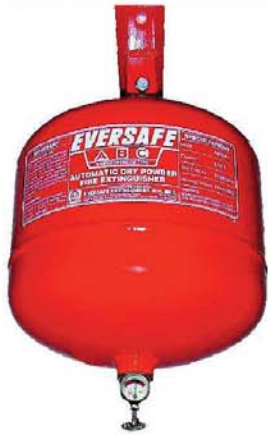
AUTO-P 4.5 AUTO-P 6