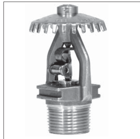
Sprinkler Identification Number RA1124